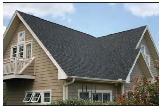
Figure 15. In the example above, about 25% of the total roof area feeds water to the downspout.