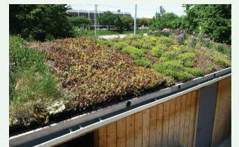
Figure I.2. Practices Included in the Manual